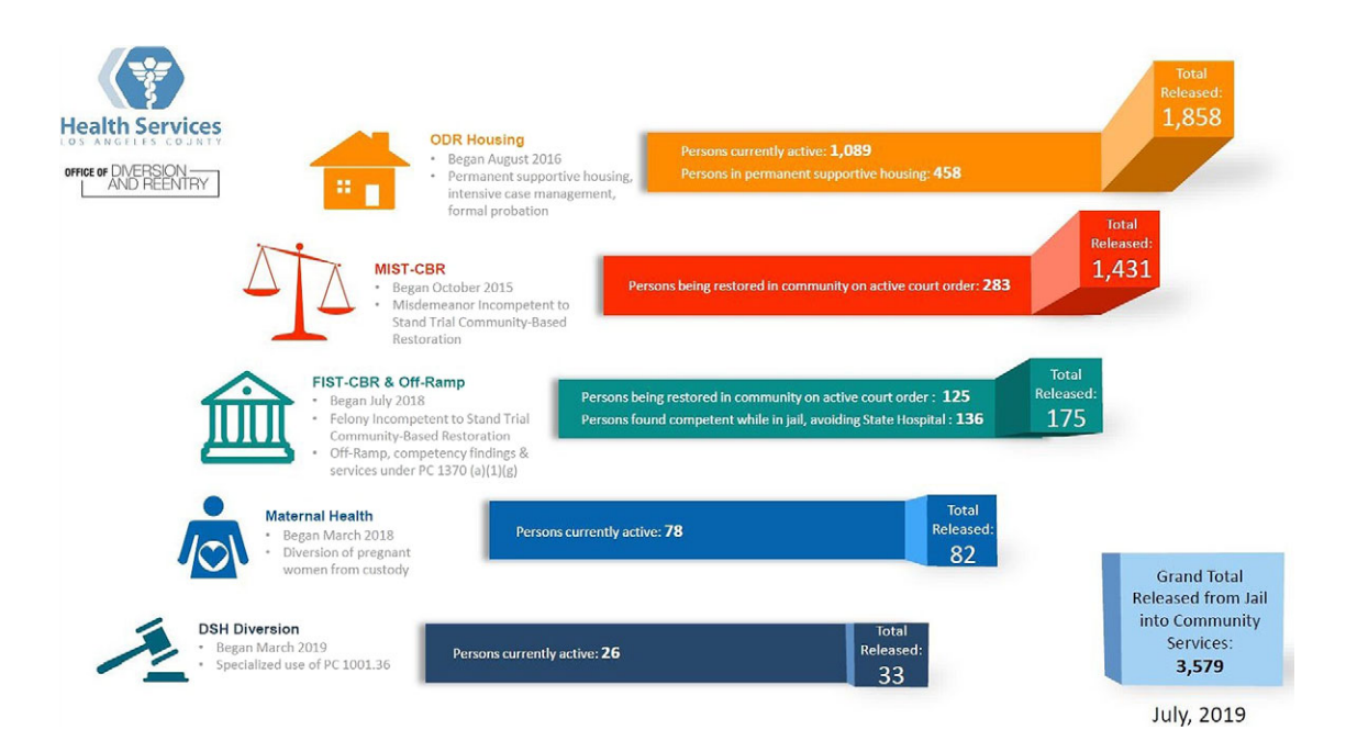
FIGURE 1. Office of Diversion and Reentry diversion dashboard.

fragmented, allowing them to function as a whole rather than as a set of independent pieces. The Los Angeles model works to create that "reserve" through the Office of Diversion and Reentry (ODR), which connects institutions and justice partners on clinical matters and public health solutions. Through elaborate clinical interventions on behalf of persons with serious mental disorders in custody, connections are made between jail and court, community and hospital, clinic and housing, and back again.